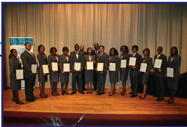
2010 Youth of the Year Candidates and Award Winners

Learn more about the positive impact the Youth of the Year Program is making on our Club kids! Watch the video from Youth of the Year 2009! Visit www.atlyouthoftheyear.org .